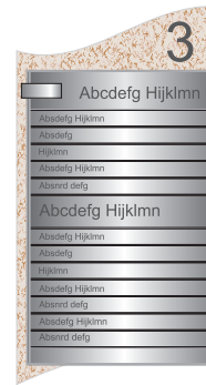
Directory Directory 36" x 24"