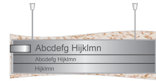
Directional • Directional 8" x 36"