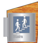
Projecting • Projecting 12" x 12"