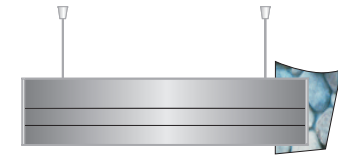
Directional • Directional 8" x 36"