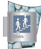
Projecting • Projecting 12" x 12"