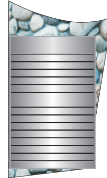
Directory • Directory 36" x 24"