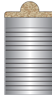
Directory • Directory 36" x 24"