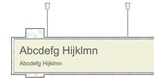
Directional • Directional 8" x 36"