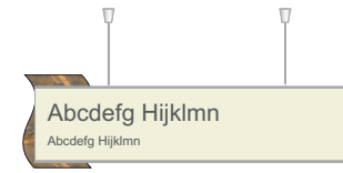
Directional • Directional 8" x 36"