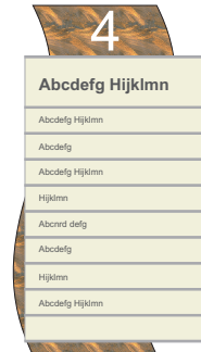
Directory • Directory 36" x 24"