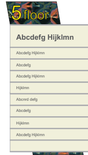
Directory • Directory 36" x 24"