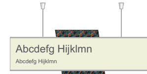
Directional • Directional 8" x 36"