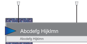
Directional Directional 8" x 36"