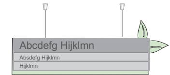
Directional • Directional 8" x 36"