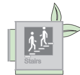
Projecting • Projecting 12" x 12"